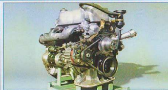
TD-2000 F DI Diesel Engine