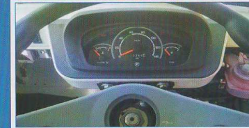
Stylish Instrument panel

NOTE : On account of continuous Research and Development, specifications are subject to change. The data included herein is to be regarded as approximate. Accessories shown may not necessarily be part of standard equipment.