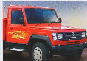
Wrap around Indicators, Stylish Square Head lamps & attractive decals