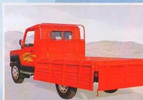
Convenient loading & unloading from any side