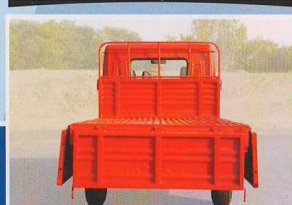
Extra-large cargo space