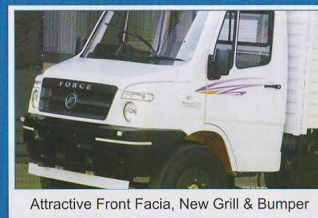
Attractive Front Facia, New Grill & Bumper