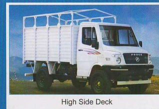
High Side Deck

NOTE : On account of continuous Research and Development, specifications are subject to change. The data included herein is to be regarded as approximate. Accessories shown may not necessarily be part of standard equipment.