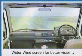
Wider Wind screen for better visibility