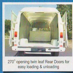
270° opening twin leaf Rear Doors for easy loading & unloading