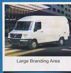
Large Branding Area