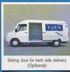
Sliding door for kerb side delivery (Optional)